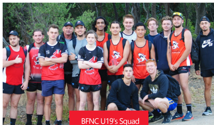
BFNC U19's Squad